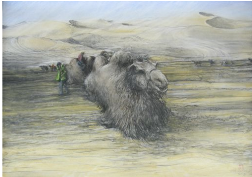
60 "Drivers resting their Camels"

55 x 78cm 2007 Pastel and ink on acid free Chinese paper 180gsm