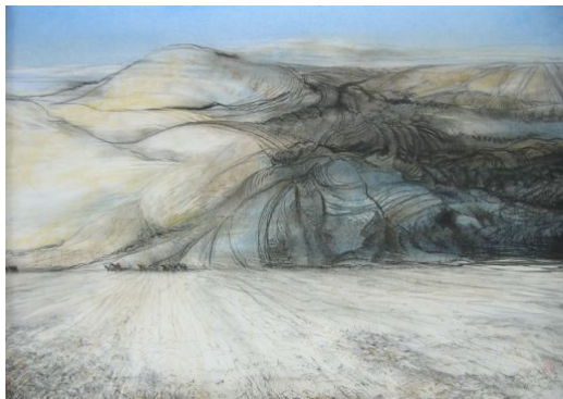
61 "Camels passing"

55 x 78cm 2007 Pastel and ink on acid free Chinese paper 180gsm