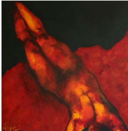
01 Etude selon reibens