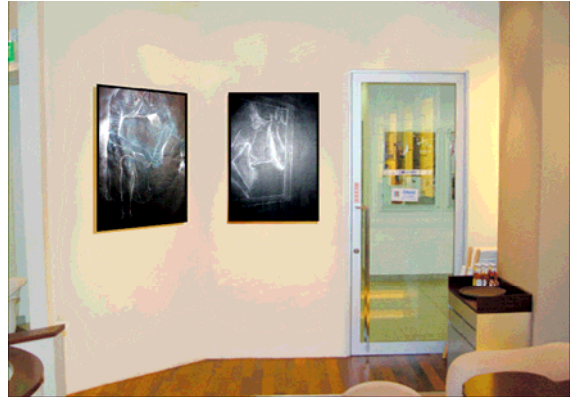
Placement of Christine's artworks in TCC

The figures are cast brightly in 'light', almost as if they cannot wait to be seen, heard and felt. The usage of graphite on black surfaces has enabled a portrayal of the figures brightly 'lit', while ironically retaining a much desired subtlety, to hint at a refrain of the self from over-asserting itself.