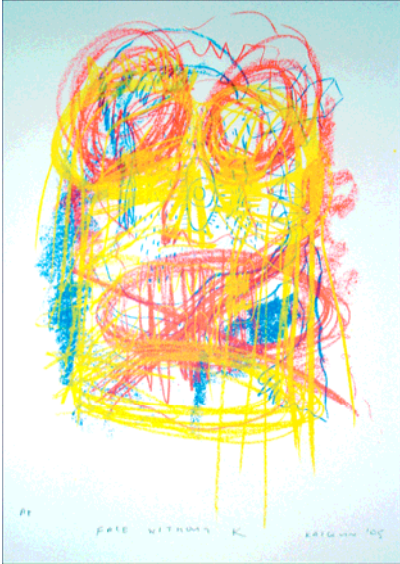
Title: Face Without K Dimensions: 60cm X 40cm Medium: Screenprint Price: $400.00