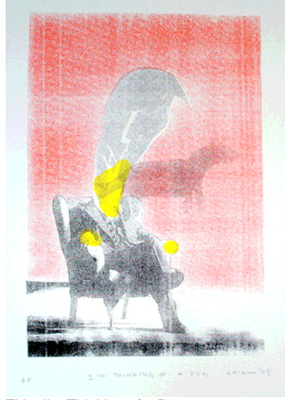
Title: I'm Thinking of a Dog Dimensions: 60cm X 40cm Medium: Screenprint Price: $400