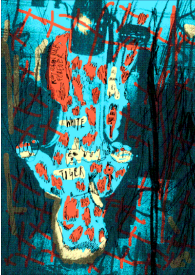
Title: Hi Mum, Hi Dad, I'm Upside Down Dimensions: 70cm X 50cm Medium: Screenprint Price: $1000.00