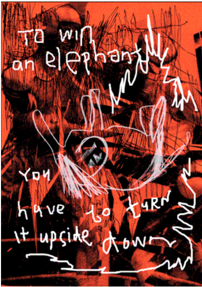
Title: You Have To Turn It Upside Down Dimensions: 70cm X 50cm Medium: Screenprint Price: $1000.00