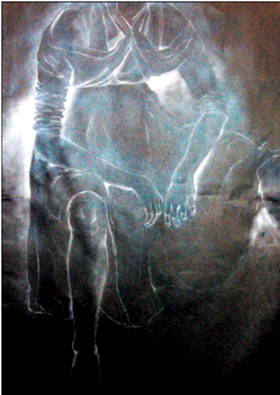
Title: Attitude Dimensions: 117cm X 86cm Medium: Graphite on Paper Price: $1000.00