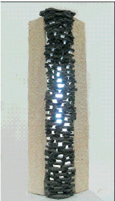
Title: Rock Dimensions: 56cm X 18cm X 18cm Medium: Clay Price: $280.00

I also integrated lightings into the work, "Rock", because I wanted it to be functional. The rawness of the clay was preserved to strike a chord with nature.