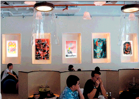
Placiment of Kaiqun's artworks in TCC