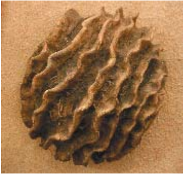
Title: Coral Series Dimensions: Variable Medium: Ceramics Price: Negotiable