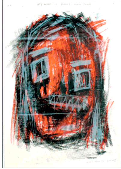
Title: My Head is Bigger Than Yours Dimensions: 60cm X 40cm Medium: Screenprint Price: $400.00