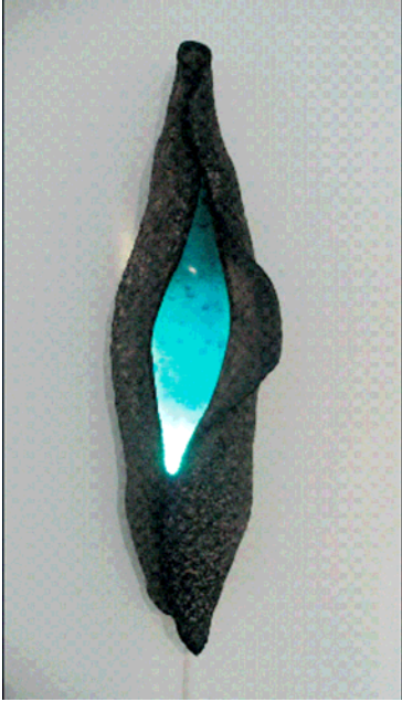
Title: Sea Form Dimensions: 62cm X 14cm X 14cm Medium: Clay and Resin Price: Not For Sale