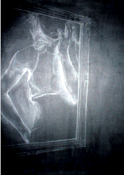
Title: Watched Dimensions: 80cm X 60cm Medium: Graphite on Canvas Price: $700.00