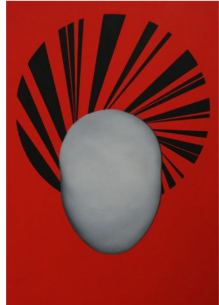
2007, Secret 1, Oil on Paper, 100 x 70 cm

Friday, Saturday & Eve of Public Holidays 11:00am to 02:0am